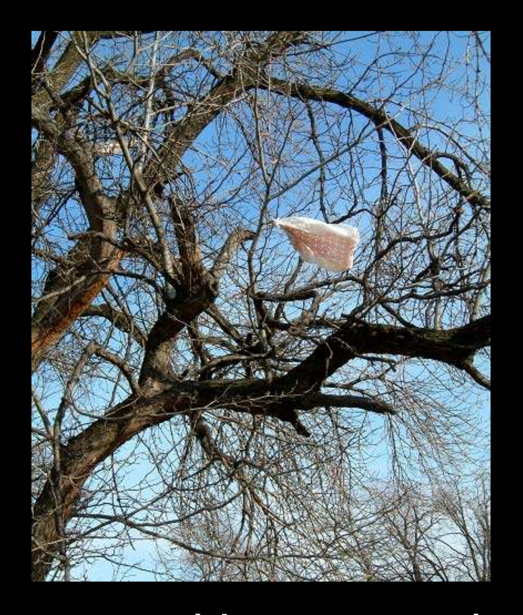
Bags get blown around...