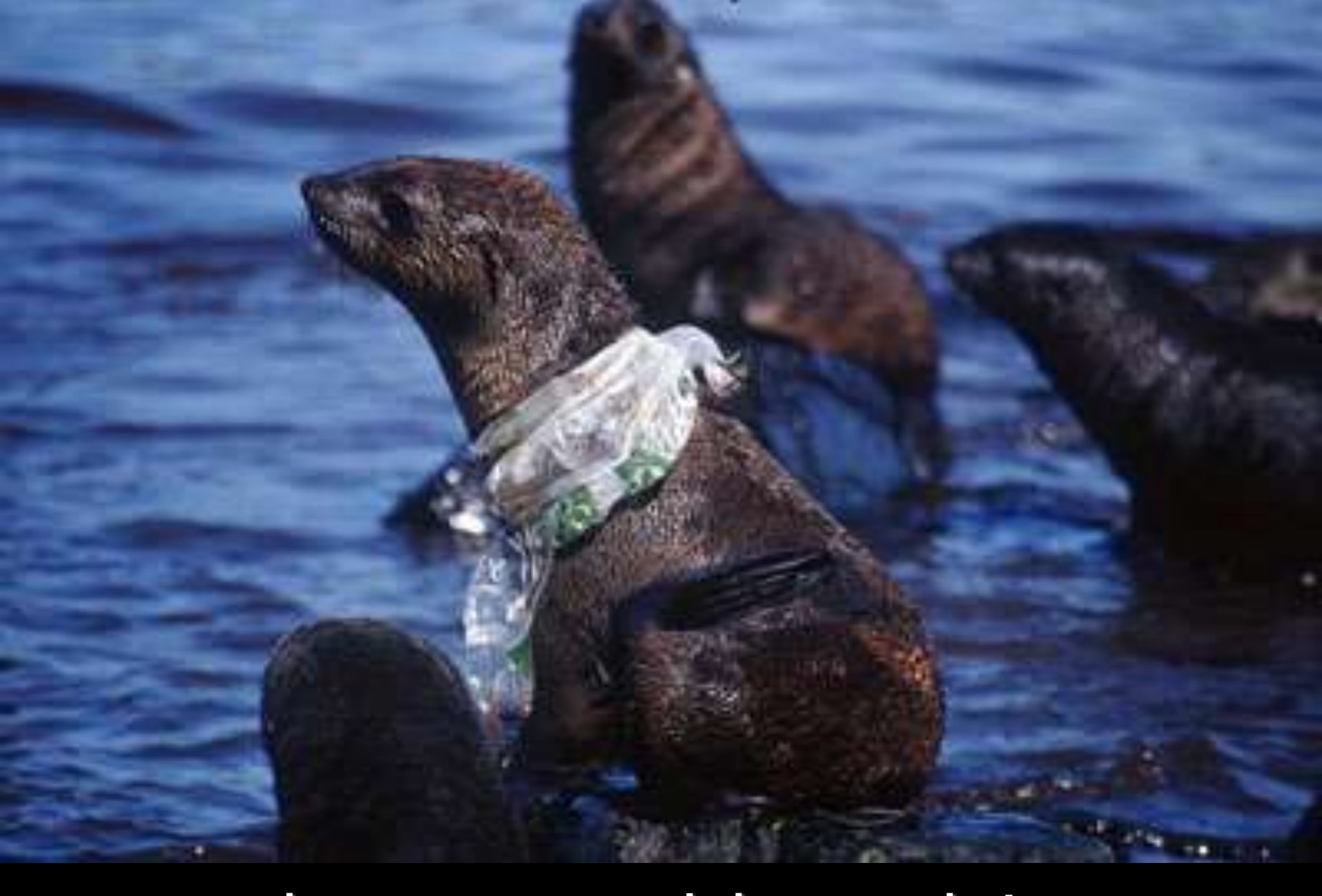
...and to our seas, lakes and rivers.