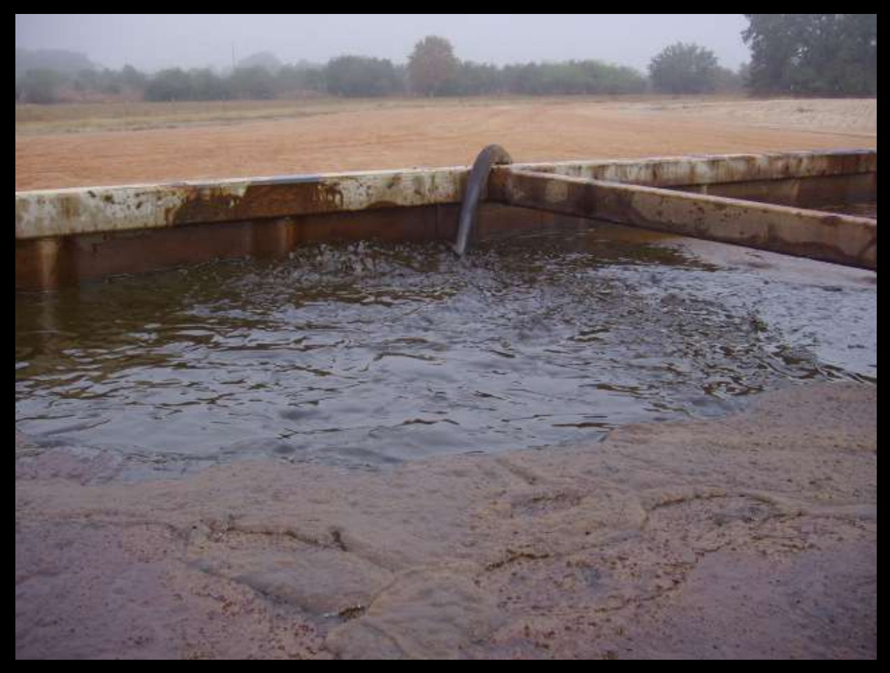
- CNN.com/tecnhology November 16, 2007