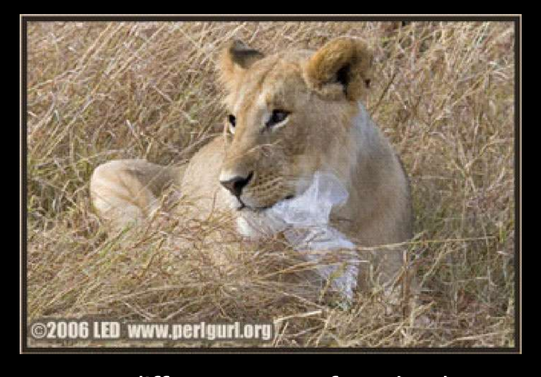
...to different parts of our lands