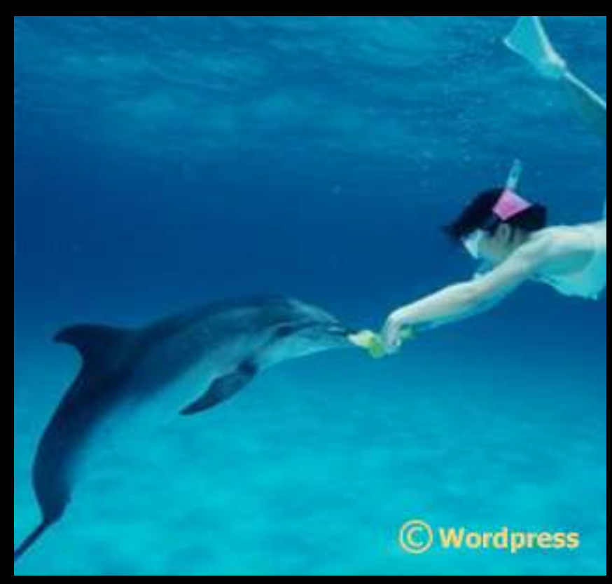
- World Wildlife Fund Report 2005